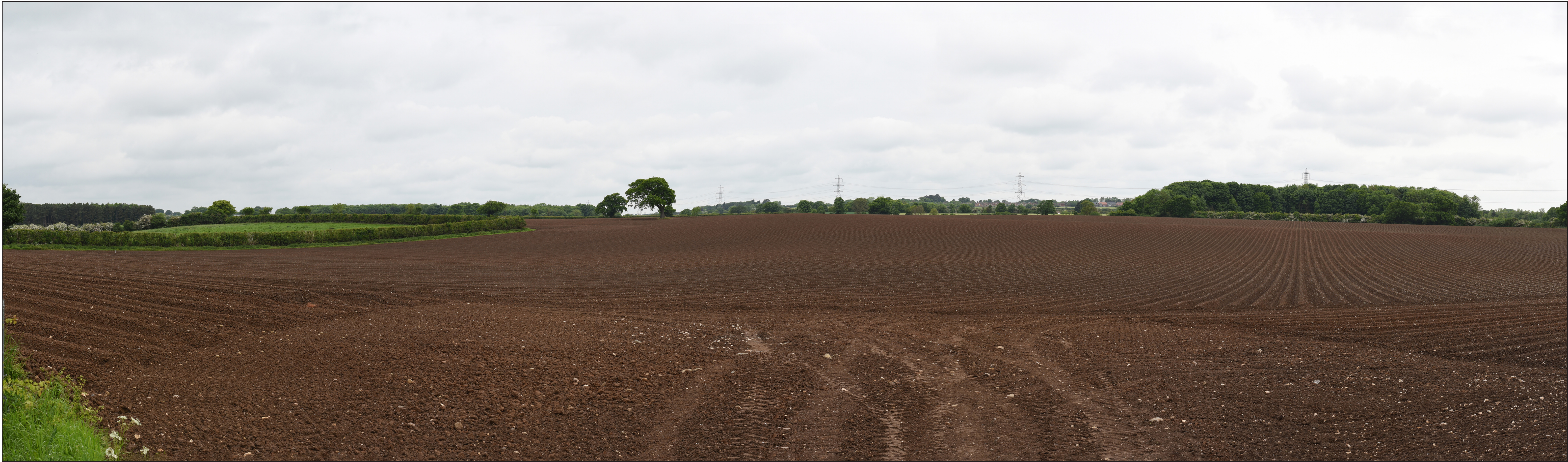
Baseline photograph - Zone 4